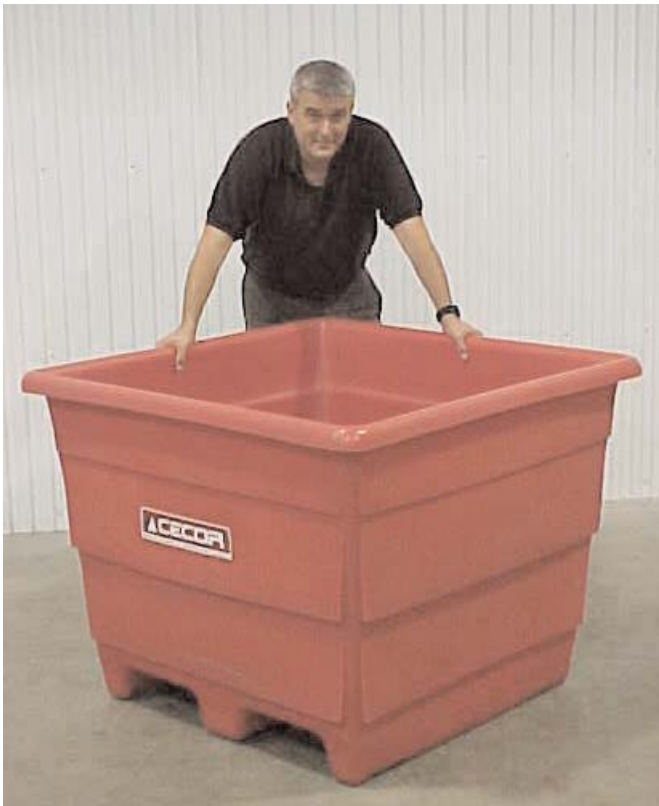
PA-328 Multi-Use Poly Bin

CECOR's Multi-Use Poly Bin is ideal for in-plant and interplant bulk handling and shipping of industrial materials and preprocessed food products. This linear low density polyethylene (LLDPE) plastic container weighs less, costs less and is easy to clean. Molded pallet base features optional two-way or four-way entry for easy moving by fork truck.